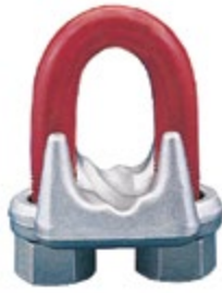
G-450 Red U-Bolt® Clip